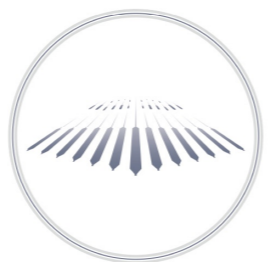
D-Konquer™ 外周球囊扩张导管