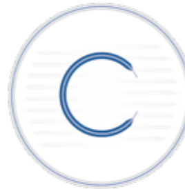
D·Kaptain™ PTA High Pressure Balloon

Scoring balloon with flexibility & crossability