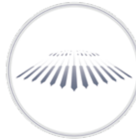
D·Konquer™ PTA Balloon